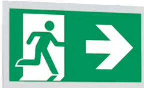
11811 CGLine+ with LED pictogram PR