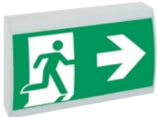
48011 1-3/D LED CGLine IP54 with cover PR