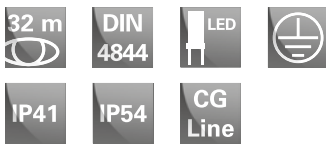
48011 1-3/D LED CGLine IP41 with cover PR