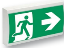
SV EURO 1 with pictogram PR