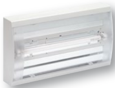
SV EURO 1 mit clear cover