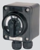
3-pole, 10 A 0-I