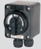
3-pole, 10 A 0-1