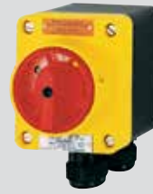
3-pole EMERGENCY STOP